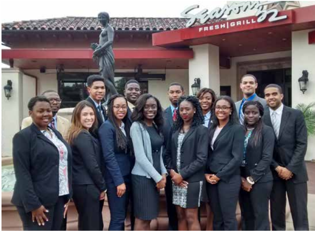
BHLI Scholars at Seasons 52 following Etiquette Dinner