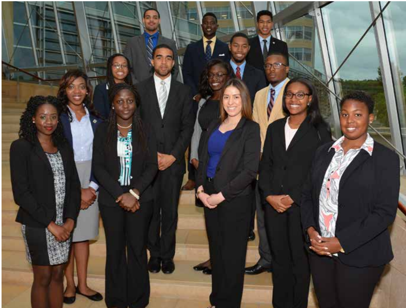
2015 BHLI Scholars pictured at Cerner Corporation Headquarters